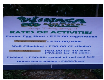
The Winaca Villlage offers these fun filled recreational activities.

If you are not confused, you are not paying attention."