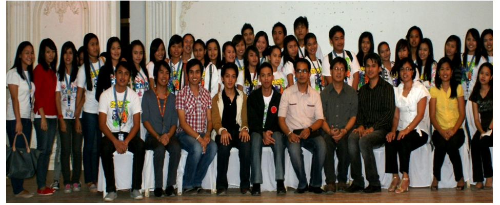
Pre - Congress at Cagayan State University